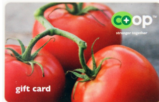
YFC Gift Cards Available in any amount